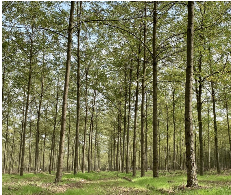
Fig. 3: 8-year old 'Turbo Obelisk' clones on low quality, sandy soil