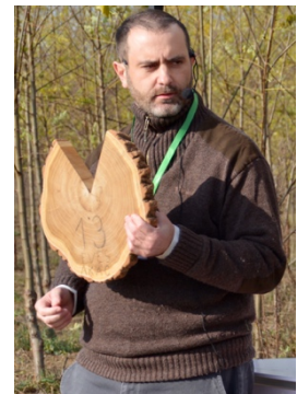
Fig. 4: 13-year-old plus tree

Based on our extensive site exploration activities, we can safely assume that the growth of black locust is affected by the aeration and hydrological conditions of the geological layer up to a depth of 10-12 meters, including the usage of groundwater. If the porosity of the above-described layer reaches an adequate level, and