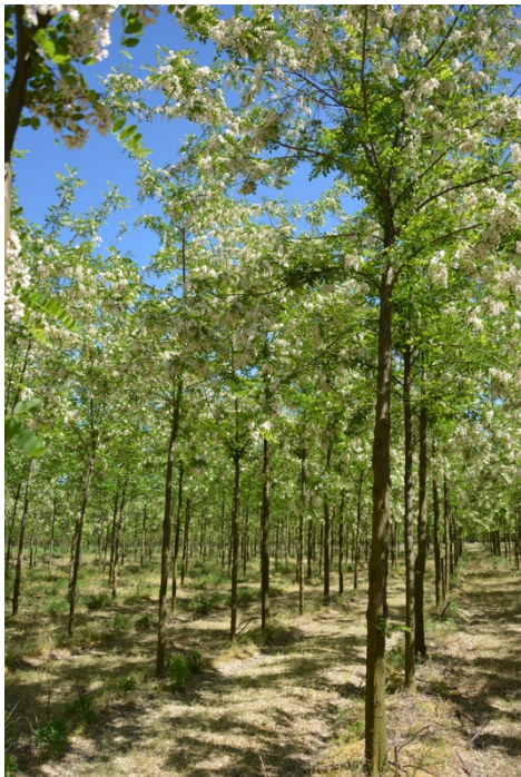
Fig. 2: Flowering 4-year old 'Turbo Obelisk' clones on low quality, sandy soil

2–6 May 2022 | Coex, Seoul, Republic of Korea